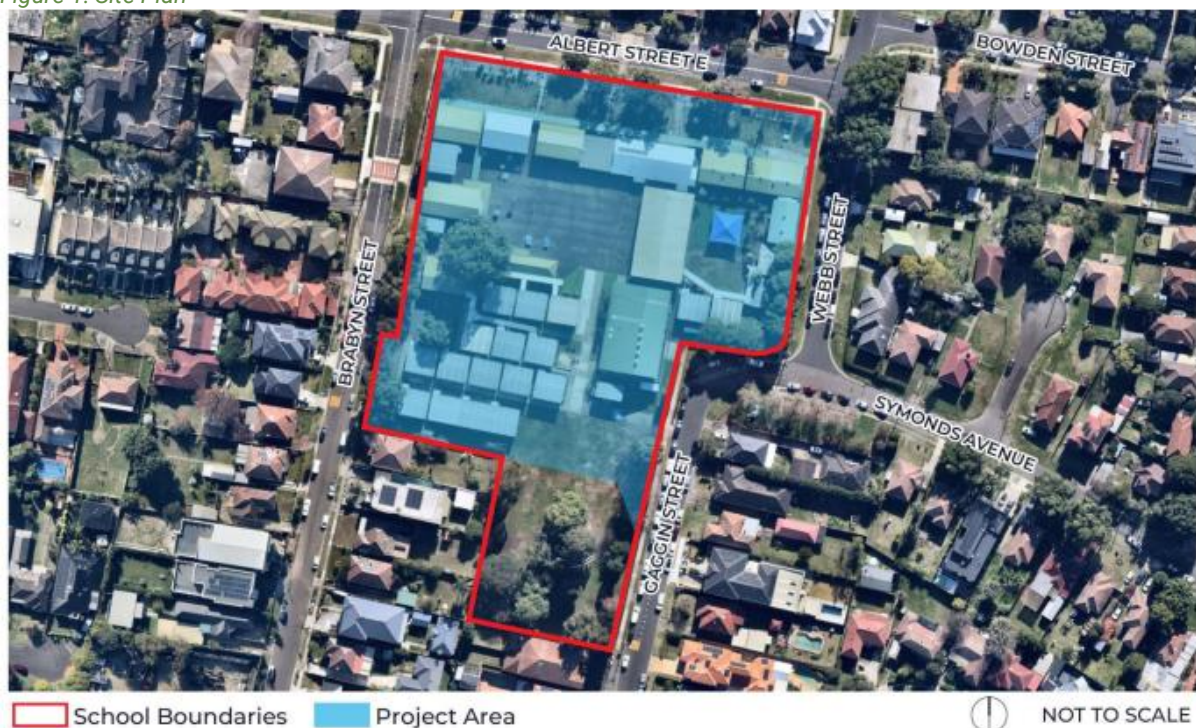
Figure 1: Site Plan

An aerial image of the site is shown at Figure 1.